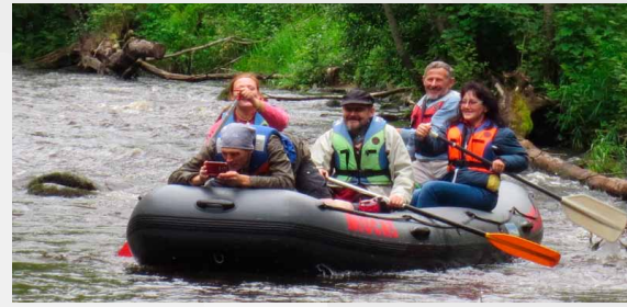
Boaters on River Brasla