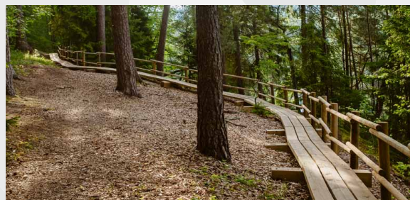
Trait in Gauja National Park

Deep ravine with a small brook dividing the left initial bank of the primeval valley of the River Gauja. On the southern side, there are stairs leading down to the riverside.