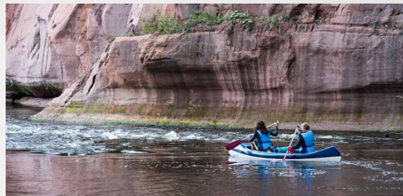
Canoeing at Ķūku Cliffs