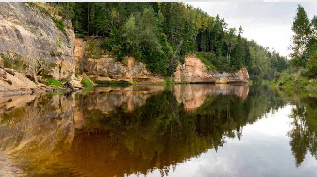
Ergļu (Ergēļu) Cliffs