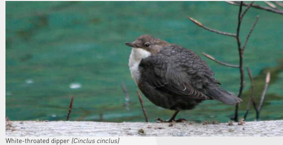
White-throated dipper ( Cinclus cinclus )