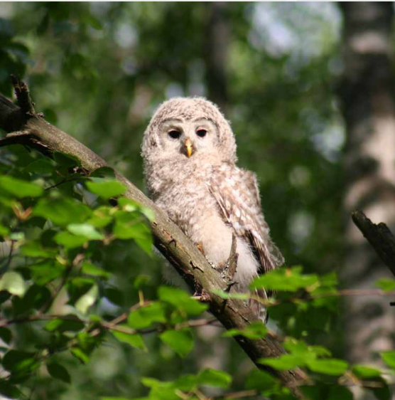
The Ural Owl ( Strix uralensis )