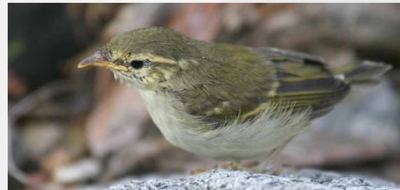
The Greenish Warbler ( Phylloscopus trochiloides )