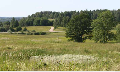
Landscape of Āraiši