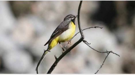
The Grey Wagtail ( Motacilla cinerea )