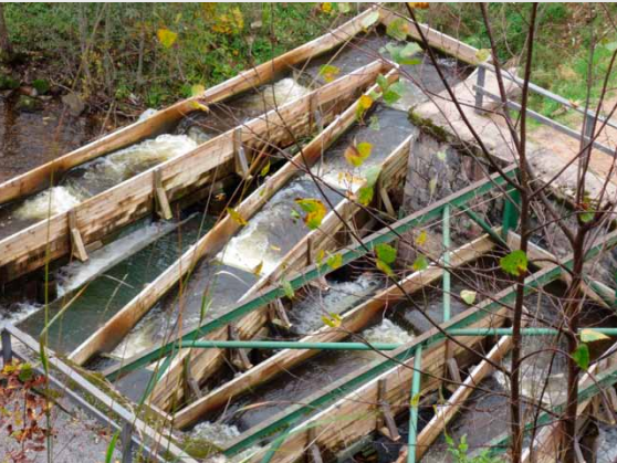
Fish ladder in Līgatne